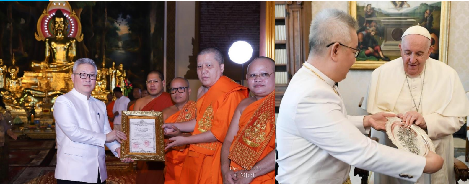
Dec 29, 2022 MJQF

Mengly J. Quach Foundation has implemented four main programs in 24 provinces across Cambodia, including Phnom Penh, Kampong Cham, Kampong Chhnang, Kandal, Kampot, Kep, Svay Rieng, Prey Veng, Kampong Speu, Koh Kong, Preah Vihea, Preah Sihanouk, Tbong Khmum, Battambang, Kratie, Pursat, Siem Reap, Banteay Meanchey, Oddar Meanchey, Stung Treng, Kampong Thom, and Rattanakiri provinces.