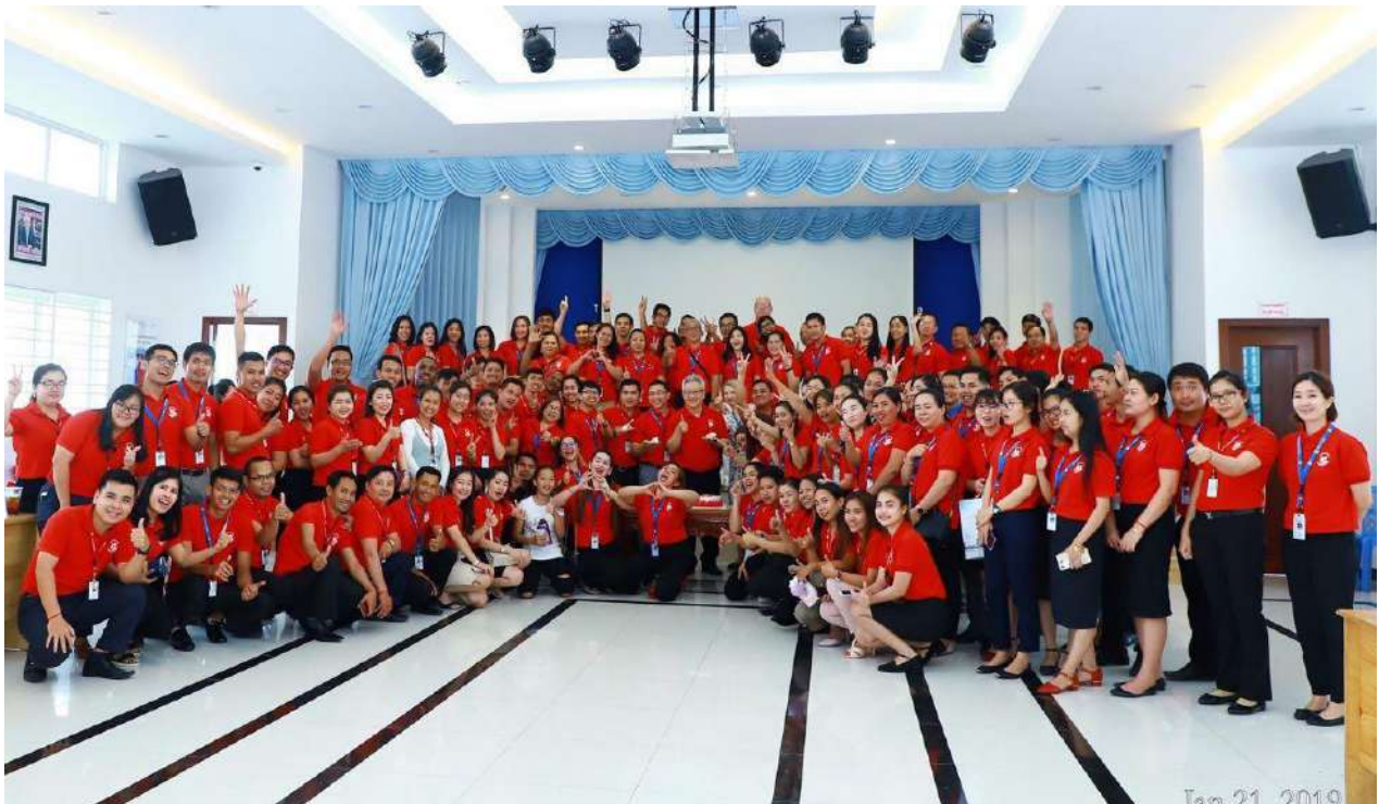
Staff Capacity Building